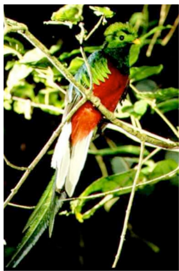
The elusive Quetzal

JULY OR AUGUST, 2007 ¡ESPAÑOL RÁPIDO! AND JOURNEY OF PEACE